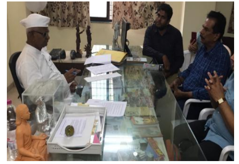
Field trip to Ralegoan Sidhi and discussion with renowned Gandhian and Social reformer Shri. Anna Hazare